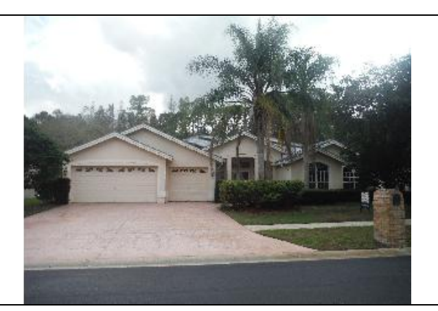
Front of structure