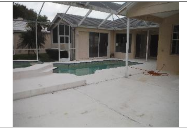
Back of structure